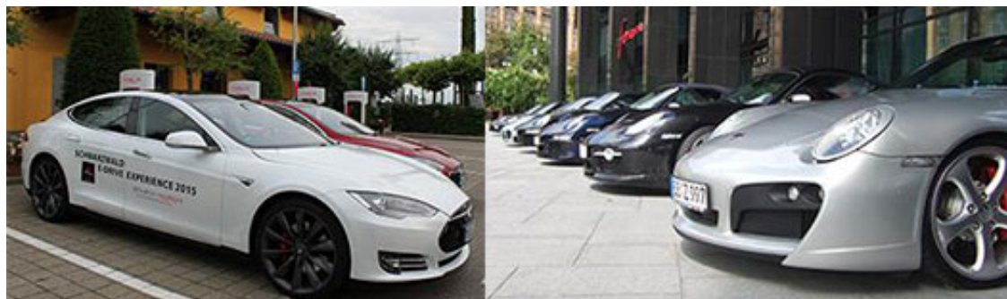
Exclusive New Driving Incentives from TAO